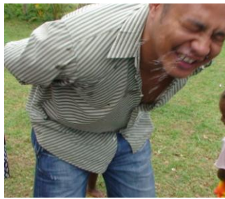
ABOVE: Big pikinini trying to pick up fruit from a bowl of water with his teeth. BELOW: Small pikinini showing the Pastor how it's really done.